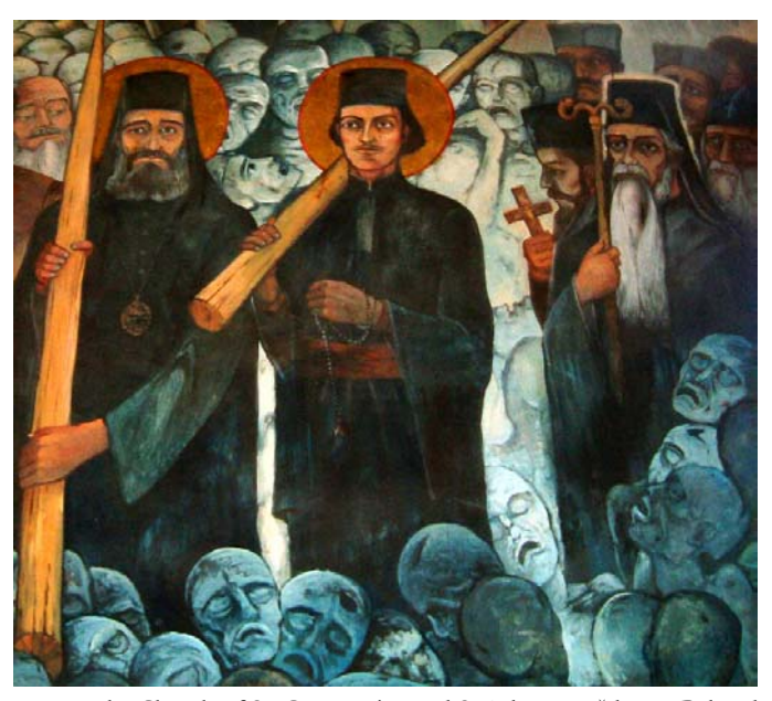
Fig. 1 Fresco at the Church of St. Constantine and St. Jelena, Voždovac, Belgrade.